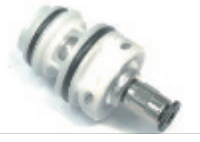
RCVA1 Straight Fitting Type